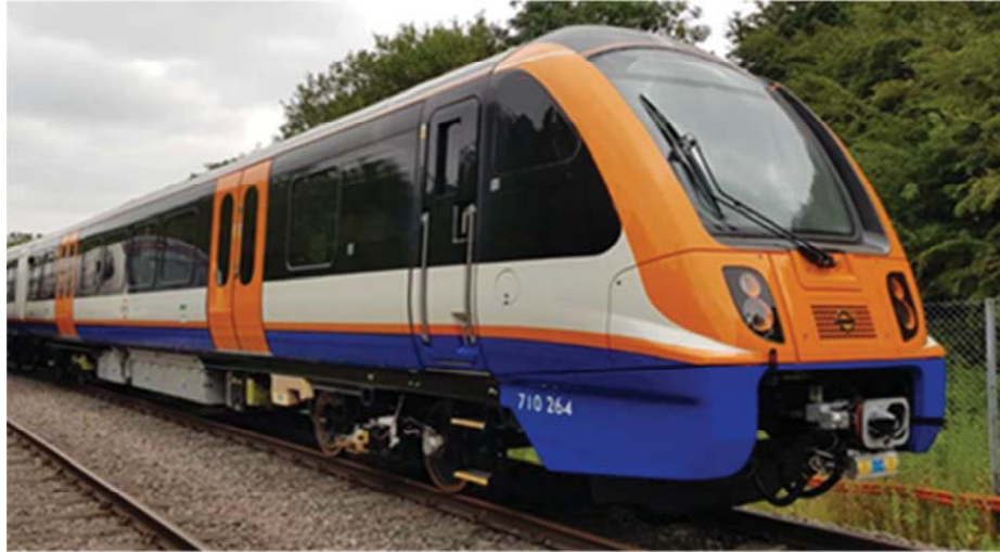
Built by Bombardier Transportation UK, Derby 2015-2019. Entering service in 2019 Maintained by Bombardier Transportation